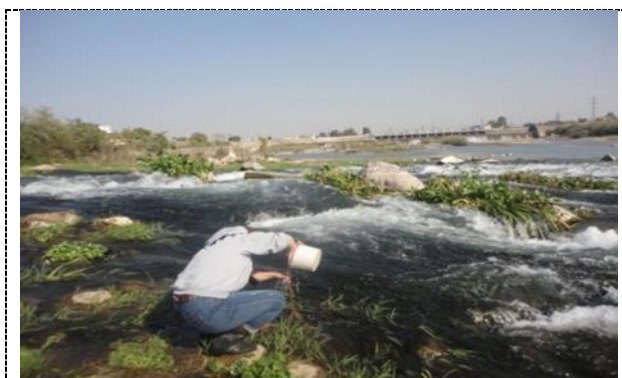
Figure 3. Place of discharge of industrial runoff from the “Maksam – Chirchik” plant into the river

Irrigation also leads to an increase in the water table and increases secondary salinization of soils. Also, data from the district and city centers of sanitary protection zones (SPZ), including our findings, prove a poor ecological state not only in the watercourses but also on the river banks. On the river banks there are no sanitary protection zones (SPZ), while the Law of the Republic of Uzbekistan “On Nature Protection”, Art 9. 12. 1992 envisages them.