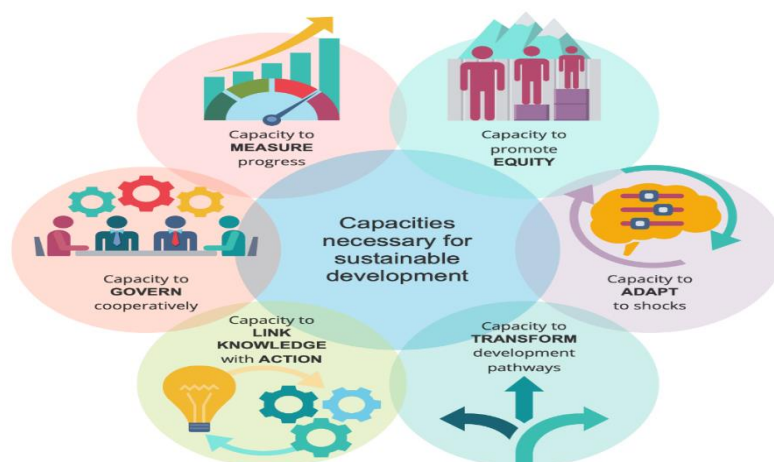
Fig. 3. Innovation and infrastructure Sustainable Development.

1829) introduced the first theory of evolution. He believed that the influence of the external environment is the most important factor in the evolutionary changes of plants and animals. Ecological data of the 19th century (A. Humboldt) gave rise to a new ecological direction in the geography of plants. In 1859, Ch. Darwin, in his book "On the Origin of Species by Natural Selection", believed that the struggle for existence in nature, that is, the manifestations of any conflicts between the species and the environment, leads to natural selection and is the driving force of evolution.