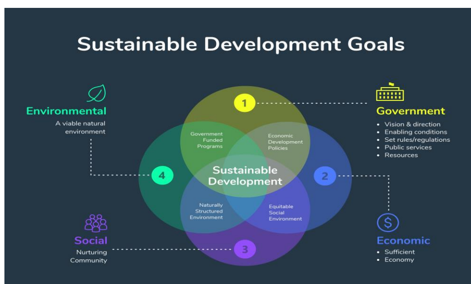
Fig. 2. Sustainable Development via Environmental development.

At the present time, when the problems of the environment and nature protection have intensified and become extremely controversial, balancing the relations between nature and society is one of the main tasks. The problem of interaction between nature, man and society is one of the eternal problems. Nature is the living environment of society, the source of meeting its material and spiritual needs.