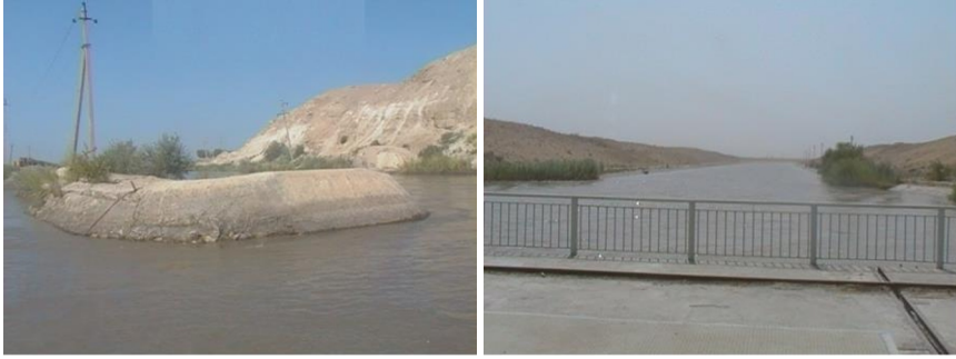
Fig.5. Destruction and siltation of sections of KMC canals "Compiled by the authors"

At the first level of the hierarchy of optimization calculations of the MWS, the criterion is the minimization of two types of losses: for filtration and evaporation.