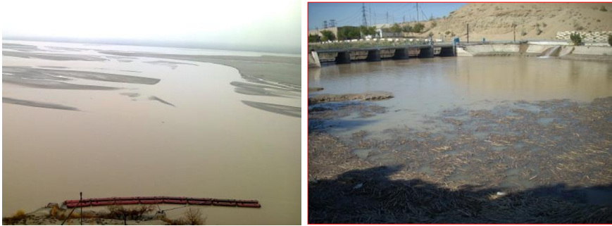
Fig.4. Combined devices for changing the structure of the flow "Composed by the authors"

Due to the increase in water temperature, while keeping all other operating conditions unchanged, the water vapor pressure increases and cavitation occurs in the pump. For each pump, there is a certain minimum value H_{sV_{\min}} , which determines H_{s_{\max}} , the so-called critical suction lift.