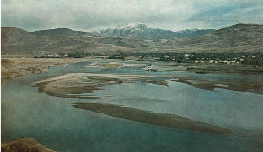
Fig.1. Valley of the Chirchik, the largest tributary of the Syr Darya "Compiled by the authors"

In the Central Asian region, the increase in water consumption for irrigation and other needs of the national economy will continue. This will lead (without the adoption of appropriate compensatory measures) to further intensification of desertification processes in the Aral Sea region. There will be irreversible changes in the hydrogeological and hydrochemical regimes of the sea - only residual reservoirs filled with water with high mineralization will remain. There will also be a further deterioration in the quality of water, both river and underground.