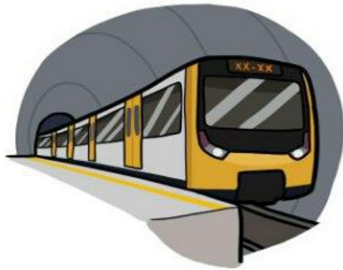
underground train UK subway train US