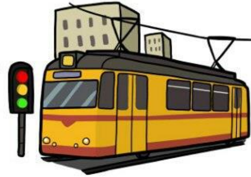
tram UK street car US