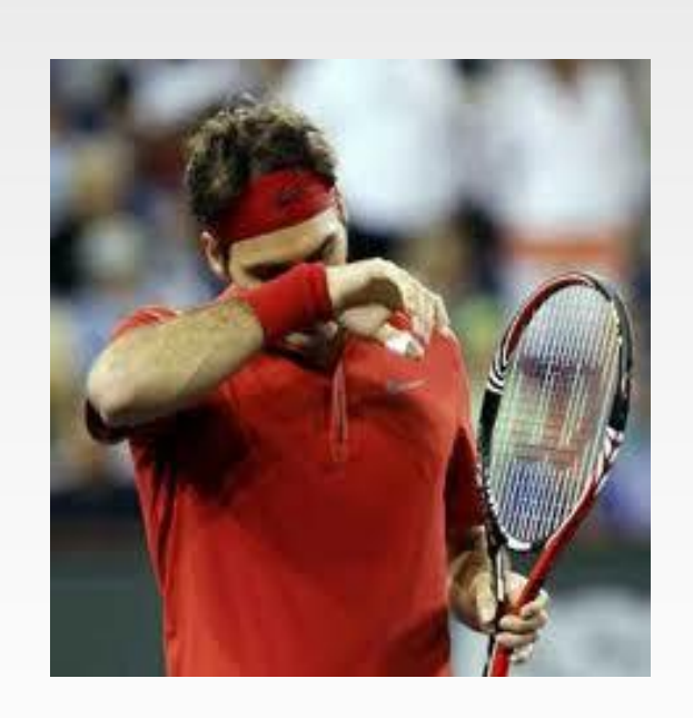
Federer has lost the semifinal match in Melbourne.