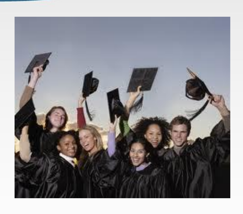
They have graduated. Congratulations!