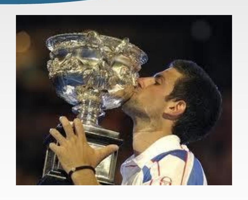
Nole has won the Australian Open for the second time.