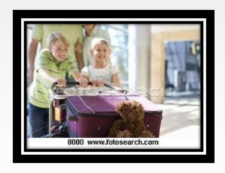
We've just come back from our holiday.

*With just to express the action finished a short time ago