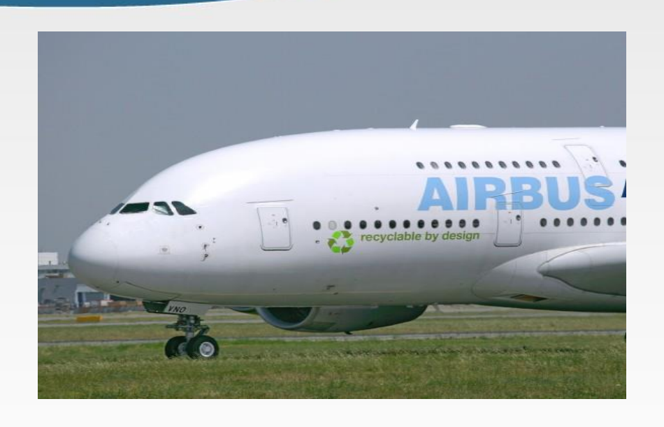
The plane has landed safely.