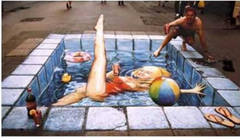
chalk drawing on pavement