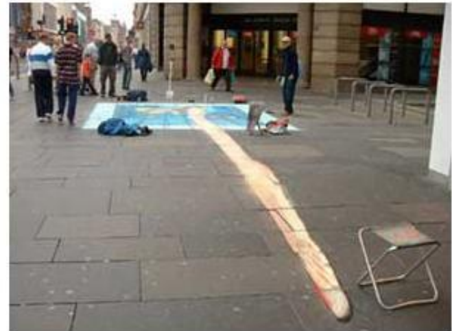
same drawing, from behind