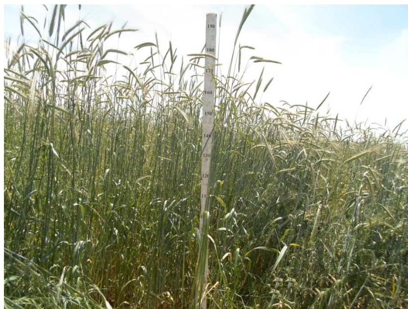
Figure 2. Nursery of triticale variety "Silver Prague"

In this nursery, two field observations were carried out and varietal characteristics were studied. The quality indicator was at the required level, and 1000 individual selections were collected from the breeding nursery. In the selection nursery, 1000 plants were studied by stem height (Table 2).