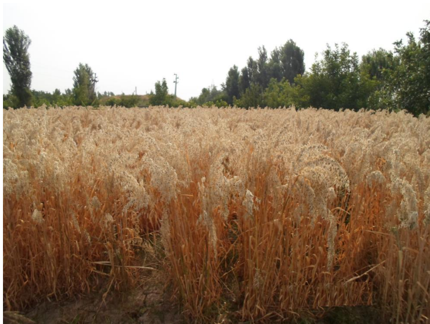
Figure: 1. Oat variety "Uzbek broadleaf"

The Uzbek broadleaf oat variety was created by scientists from the Research Institute of Livestock and Poultry and the Research Institute of Plant Breeding by multiple selection of broad-leaved late-ripening forms from sample K-11302 (Australia) in the collection of the Research Institute of Plant Industry. It belongs to the genus Avena sativa Z., species of Pugnaks. The growing season is 102-107 days for spring sowing and 190-195 days for autumn sowing.