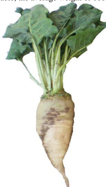
Figure 3. Root crop of fodder beet varieties "Uzbekistan-83"

As can be seen from the data in the table, the average weight of 1000 seeds was 27.3 grams.