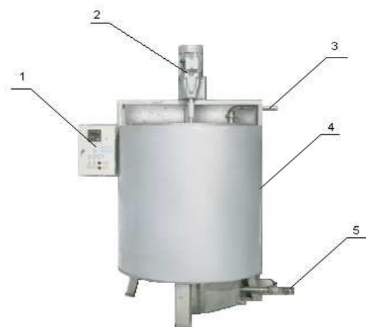
Figure 1. Bioethanol mixing device for diesel fuel under laboratory conditions: 1-control panel; 2-dispenser; 3-diesel fuel inlet pipe; 4-mixture formation vessel; 5-finished product outlet pipe

The structure and working principle of the bioethanol mixing device for diesel fuel under laboratory conditions are shown in Figure 2.