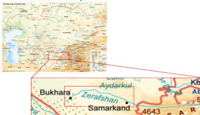
Fig. 1. Middle and lower part of the Zarafshan river basin

The object of study is the soil geosystems of the Zarafshan valley. The Zarafshan valley is characterized by a high natural discharge dynamic [5]. in the mountainous upper part located Tajikistan. Middle and lower part located Uzbekistan (Fig 1). The research objective is to study the spatial differentiation of salts in soils within the geosystems of the Zarafshan river valley.