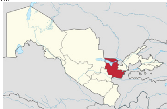
Figure 1. The location of Jizzakh region.

The regional capital is Jizzakh (pop. 179,200, 2020). Other major towns include Do'stlik, Gagarin, G'allaorol, Paxtakor, and Dashtobod. Jizzakh Region was formerly a part of Sirdaryo Region but was given separate status in 1973.