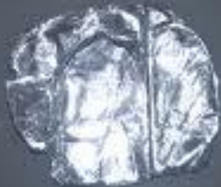
Metallic Luster (Molybdenite)