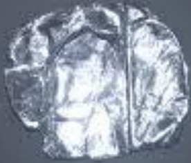
Metallic Luster (Molybdenite)