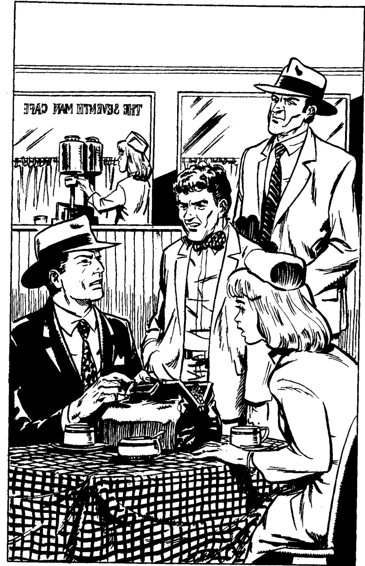
I looked up quickly and saw Jo standing beside me. His tall friend was right behind him.

Both men turned around and looked. In the doorway of the café stood Sergeant Murphy, with two other policemen. Sergeant Murphy jumped on the tall man with the gun and Jo ran back into the café. I stepped forward to stop Jo and he ran straight into me. We both fell on the floor and the two policemen ran up. One of the policemen held Jo. The other policeman held me.