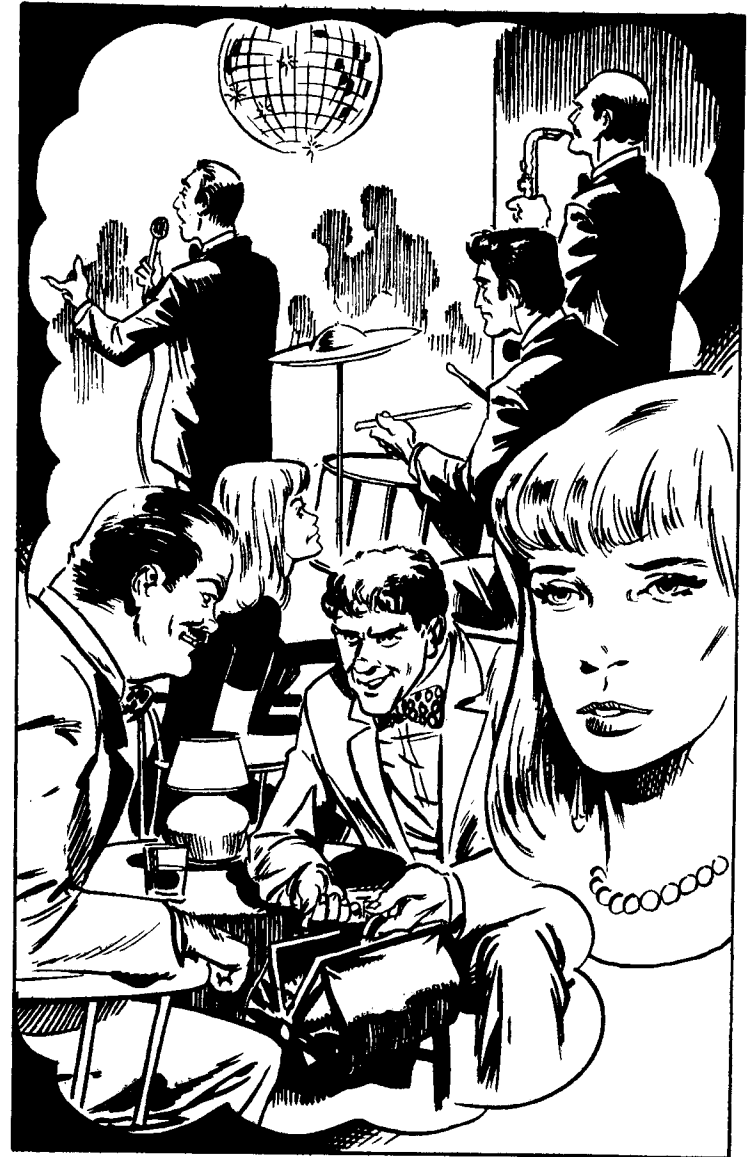
'The bag was full of diamonds and jewellery.'

'I told Benny about the bag of jewellery, later on in the evening,' continued Elaine. 'Benny was very excited at the news.'