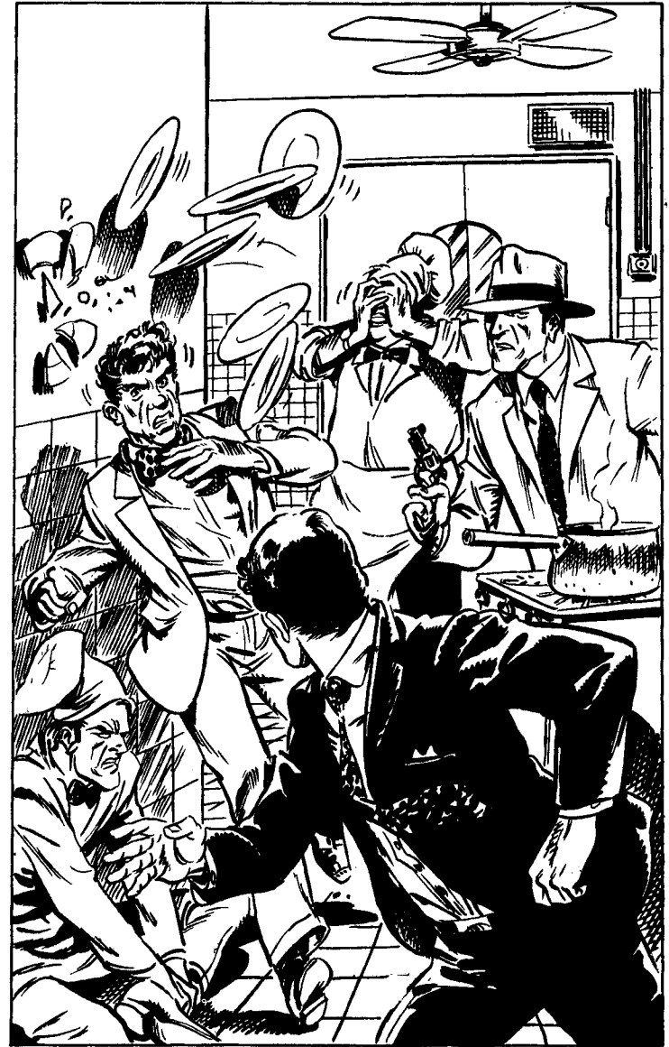
I quickly picked up a large pile of dirty plates and threw them at Jo.

I quickly picked up a large pile of dirty plates and threw them at Jo. He saw the plates coming and he tried to move away. As