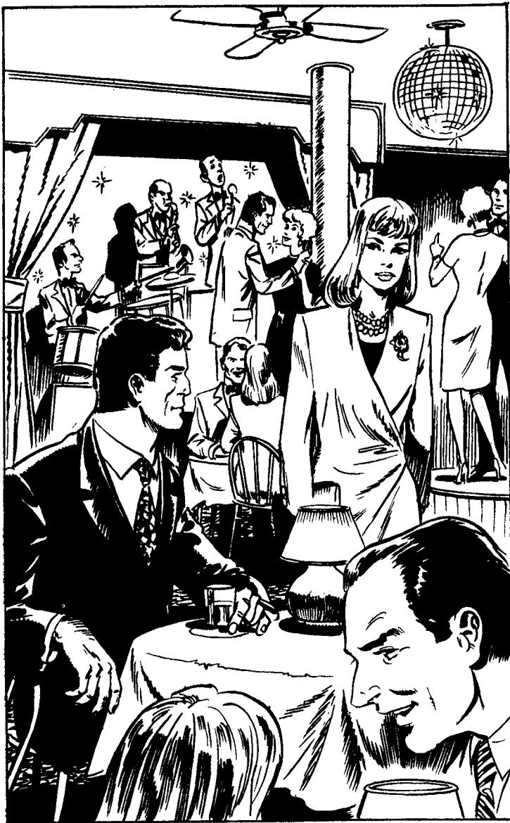
She was looking as beautiful as ever, but seemed to be a little worried.