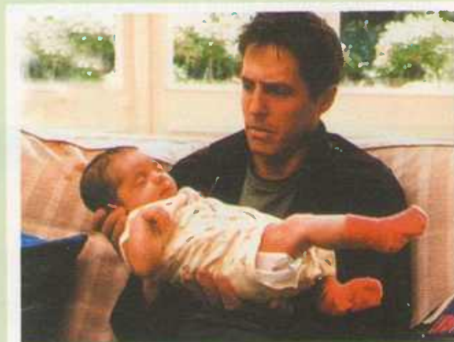
'She's erm ... delightful.'

'I love kids,' says Will (played by Hugh Grant in the hit film About A Boy ). 'Yeah, I like messing around with them, you know. I have a two-year-old, Ned. He's got blue eyes.' Will is looking for a girlfriend, but all