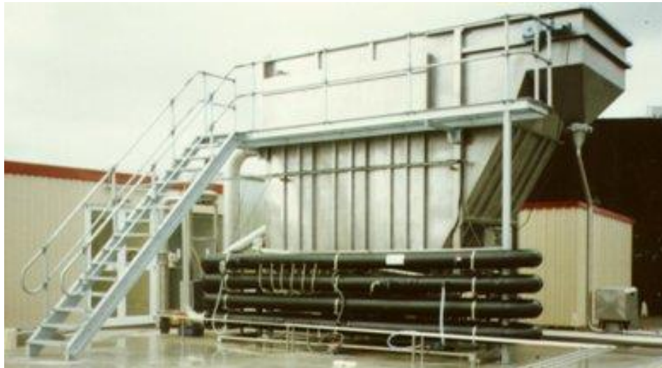
Dissolved air flotation system for treating industrial wastewater.