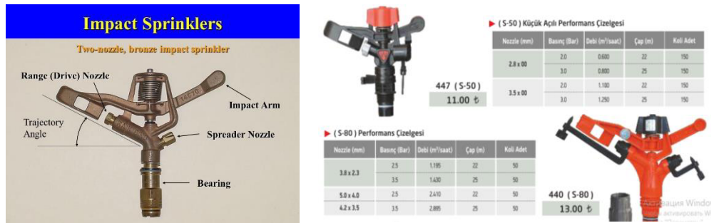
Fig 4. Types of sprinklers according to parameters

Selection of sprinklers. Sprinklers are divided into several types according to discharge and time [Fig 1]. Water consumption is divided into several types according to row spacing and other parameters. The Sprinkler type is selected according to the above parameters.