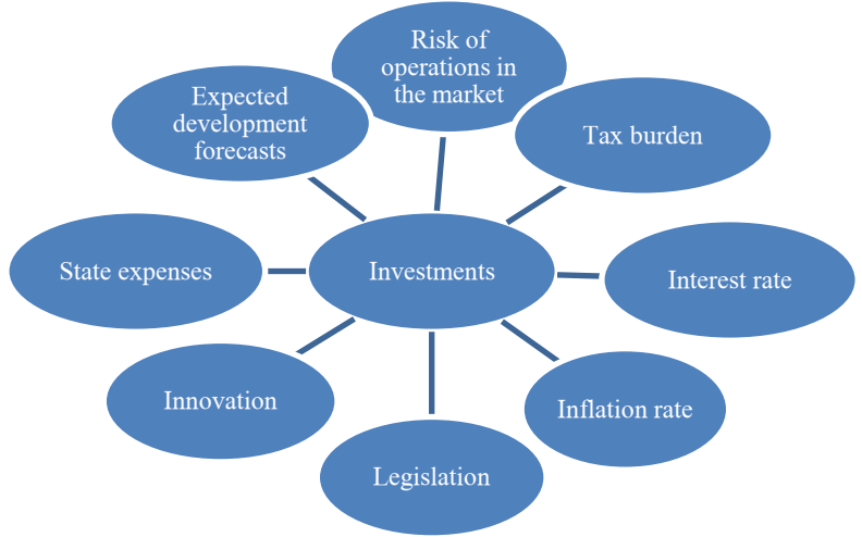
Fig. 1. Factors influencing investment decisions.

of the Republic of Uzbekistan is important for creating conditions for socio-economic development and improving the standard of living of the population.