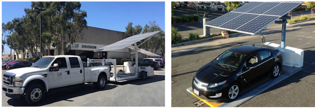
Figure 1. Mobile charging stations equipped with solar panels

Based on the characteristics of electrochemical technology for mobile devices, the following modern current sources can be cited.