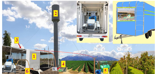
Figure-4. Charging of electric tractors in field conditions using the mobile power station "Solar Wind".

charge. The tractor is equipped with a wide array of sensors that can detect livestock and crops, as well as a collision avoidance system that allows it to work around people and other equipment[8].