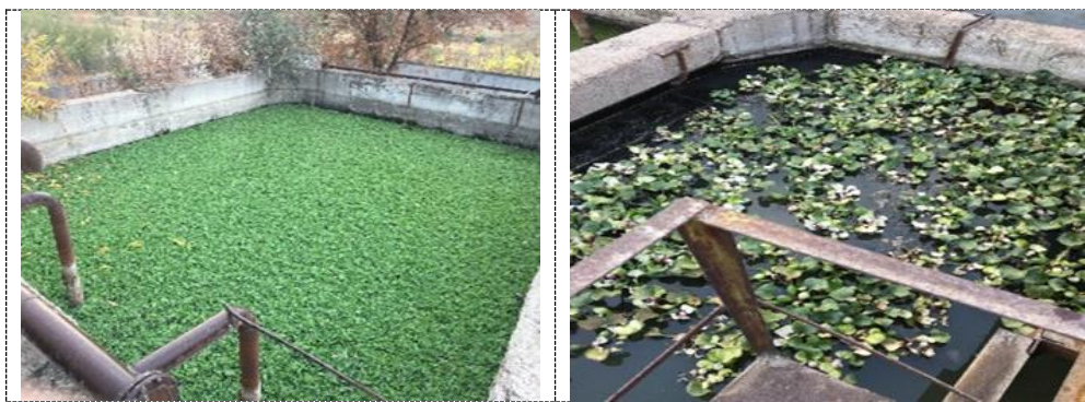
Figure 2. A view of pistia and eichhornia plants in the air-tank

Prior to experimenting in the “Binokor” Aeration Station, wastewater samples were collected from 4 points of the station to determine the chemical characteristics of wastewater. These points are from the pipeline leading to the “Binokor” Aeration Station - the first sample, the second sample before entering the air-tank facility of the station, the third sample at the exit from the air-tank facility of the station, and the last sample is the sewage from the bio-pool of the “Binokor” Aeration Station. Samples were taken at a depth of 10–15 cm from the surface of the wastewater in the air-tank. Wastewater samples were chemically analyzed twice, before and after planting high aquatic plants. (Table 2).