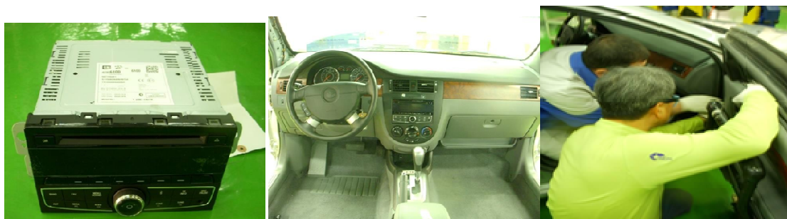
Figure 2. Radio asm-am/fm stereo & audio disc player 92199291 is replaced radio with p/no. 42356100 module.

To simplify the execution of complete compliance tests, the R&S ® CMW run sequencer software tool is added . This R&S ® CMW-KT110 option provides ready-to-use test sequences to perform end-to-end modem compliance testing and within the e Call and ERA-GLONASS band in line with applicable standards. The available packages verify the conformity of the modems within the voice band, according to the specifications CENEN16454, ETSITS103412 and GOSTR55530 (GOST33467). We can conveniently select and combine the required test sequences on the simple user interface. The R&S ® software CMW run automatically configures the test tools, the PSAP and, if supported, the IVS under test via remote control. Runs the selected tests and generates a complete test report indicating success / failure for each test case.