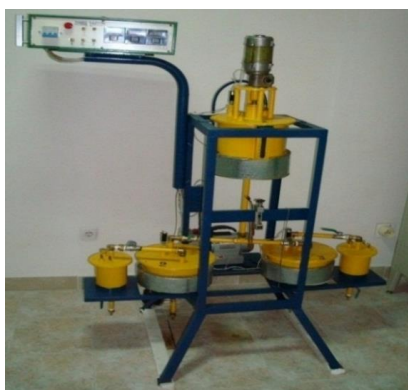
Fig. 3. General view of the experimental oil treatment plant: 1 is mixer-sump, 2 is engine; 3 is tank; 4 is sensor; 5 is rack; 6 is spiral.

Performance testing of oxidation products used motor oil, developed by the author with oil purifier brands ITAC (PWAM)-100 was conducted at agricultural enterprises yukori Chirchik district of Tashkent region following the methodology set out in Chapter 3. The purpose of the performance test was to establish the operational life of the device. At the same time, the filters were periodically regenerated and re-tested after each resource cycle. The content of organic contamination was determined by the color and acid content.