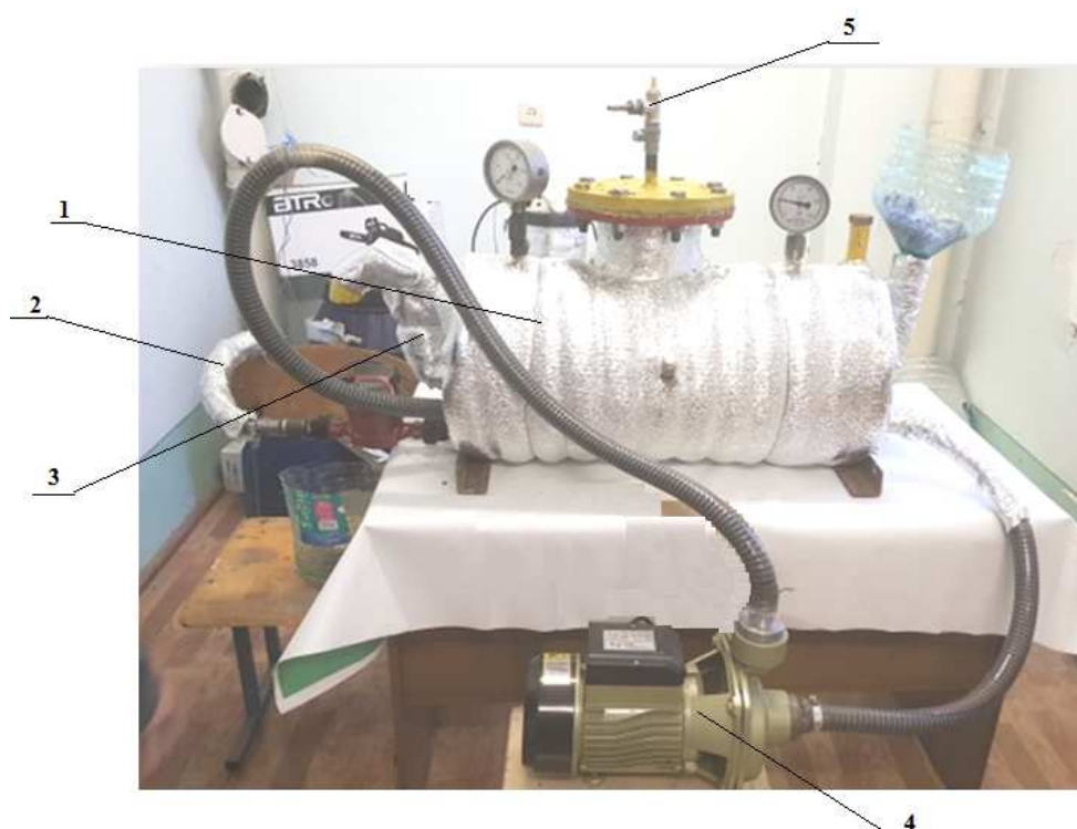
Figure 1. Multifactor laboratory device: 1-bioreactor, 2-heating systems, 3-drain pipe, 4-mixing pump, 5-biogas transmission line to the gas holder.

For the introduction of poultry manure into the anaerobic process, a number of laboratory experiments were conducted in different sizes of the dilution regime and in the pressure ranges of the released gas (-0,05...1 kg / cm 2 ) and in the temperature regimes.