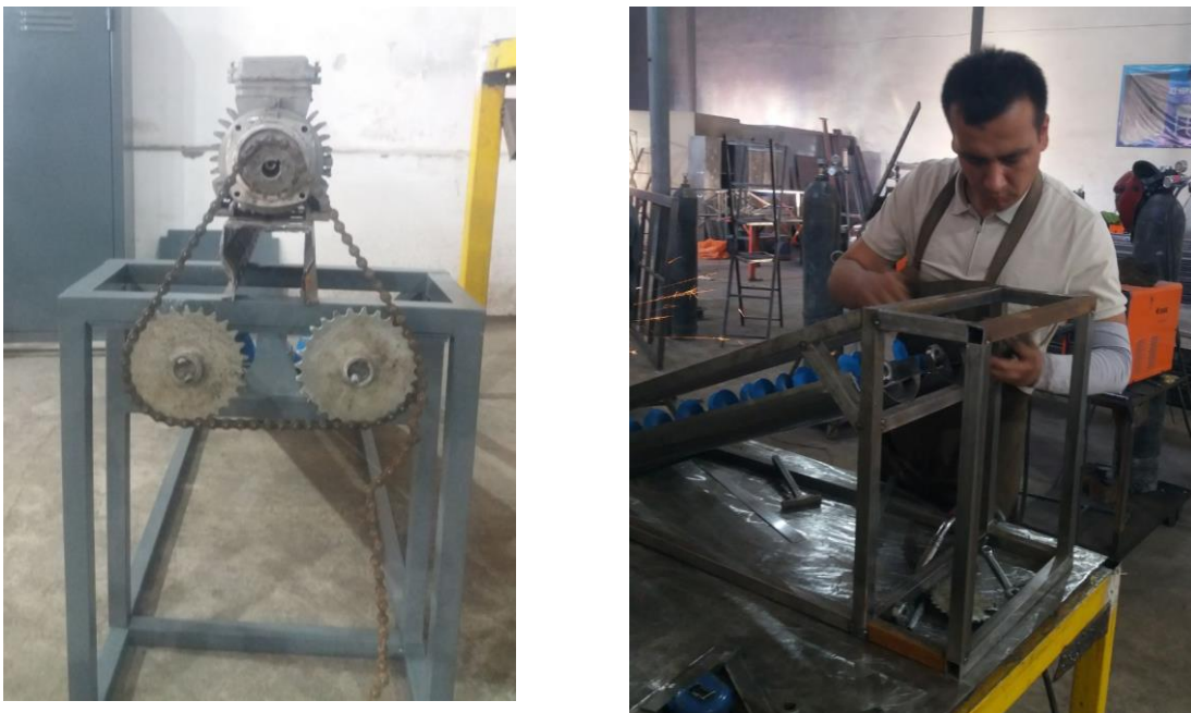
Figure 3. The process of developing a laboratory model of a small hydropower plant

The main structure of the Archimedean turbine is its structure, which is considered the outer base, and a number of parts are attached to it. Our base is designed with a slope of 24 degrees. Triangular base design, hypotenuse length 1100mm and bottom length 985mm.