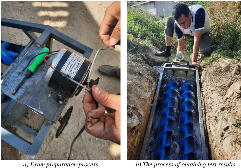
Figure 4. Laboratory testing of samples

The purpose of the experiment is to test the process of development, preparation and operation of the initial small-sized sample in laboratory conditions to create a prototype microhydroelectric power station.