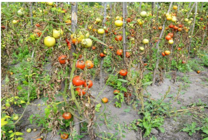
Figure 1. Tomato plants infected with tobacco mosaic viruses

The small tobacco mosaic is capable of rapid multiplication under appropriate conditions. Under the influence of external factors, on the plant organism (leaves, roots, stem), it penetrates into the plant's cellular structure in 3-4 hours and completely inhibits the entire organism of the plant-host within 25-30 days [7, 8]. In the leaves infected with TMV, a mosaic color appears, sometimes with mixed infection with other viruses, the leaves turn into threads, and the stem acquires a dark color, as in frost. The first symptoms of tobacco mosaic virus infection can be seen on the leaves of the plant. The leaf plates are covered with a kind of mottling, which later takes the form of a mosaic of light or dark green color (Figure 2) [3, 4].