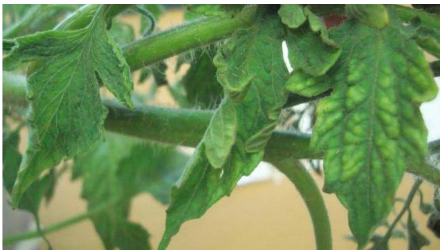
Figure 2. Change in the shape and color of tomato leaves under the influence of TMV

The tobacco mosaic virus is one of the typical representatives of a large class of viruses with helical symmetry [9, 10]. Its particles are in the form of rigid hollow rods 15-18 × 300 nm in size and consist of protomeric proteins and RNA [7, 8]. The proteins are arranged in a spiral arrangement, forming a