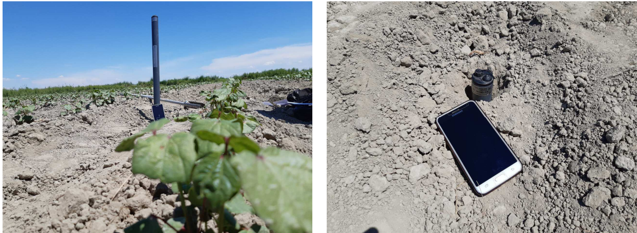
Figure 3. Process of conducting soil analysis through UMP-1 measurement device

In summary, after soil leaching, the amount of salts in the field of experimental field varied in comparison with the state of the experiment. These changes can be attributed to the fact that the amount of salts in the soil can be determined by the scientifically-based salt-based formulas recommended by scientists. In the case of soil leaching through BChC, the chemical compound has a positive impact on the salinity of the soil in the process of melting and achieving high efficiency, while less than 30% of the saline detection rate has been achieved.