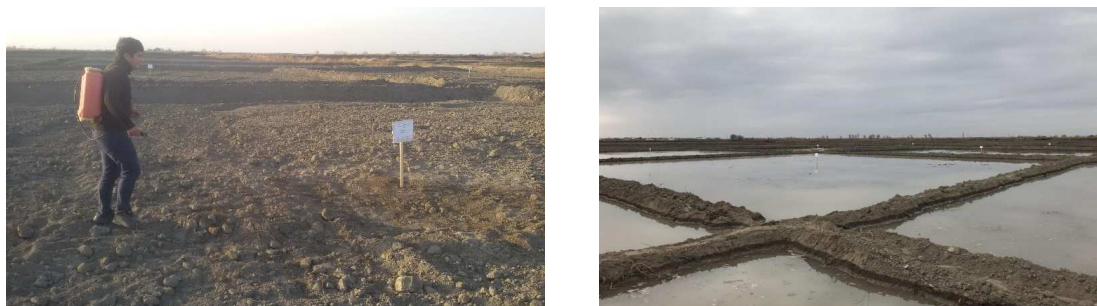
Figure 2. Process of sowing BChC by variants, and soil leaching

During the researches, soil leaching activities lasted from the first decade of January to the last ten days of January and the period between soil leaching was 19 days. Table 3 shows that the highest water consumption was consumed in the traditional way, used for soil leaching in agricultural conditions, with a biosolvent concentration ratio of up to 30% determined by the chemical compound, and 1714 cbm/ha have been consumed compared to option 2. During the experiments, the least amount of water consumed for saline was option 2, the seasonal salinity was 2906 cbm/ha, or by 37% compared to option 3, and by 30% in option 1, the efficiency of soil leaching has increased.