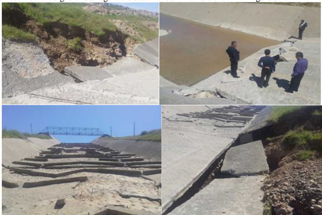
Figure 3. Damage caused by the flood in Langar reservoir.

As the result of observation of the current technical condition of all hydro-technical structures in Langar reservoir the signs of damage were determined which are shown in Figure 3.