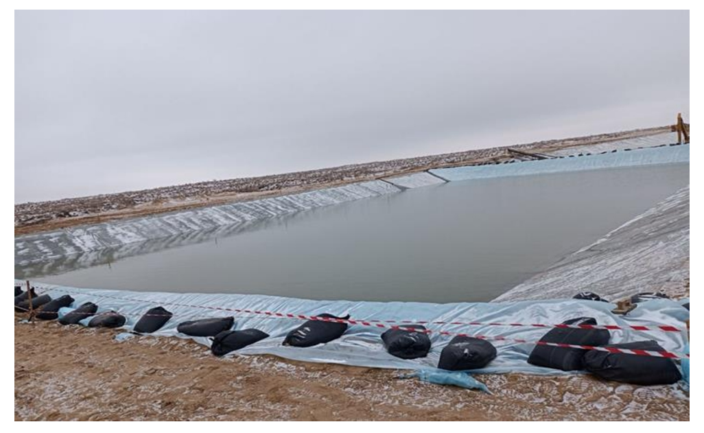
Fig. 4. Plan of experimental canalsection PK47+55 to PK48+00.

The canal was blocked on both sides by an earth temporary dam and, geocompositewas covered to prevent seepage from the pool (Fig. 4).