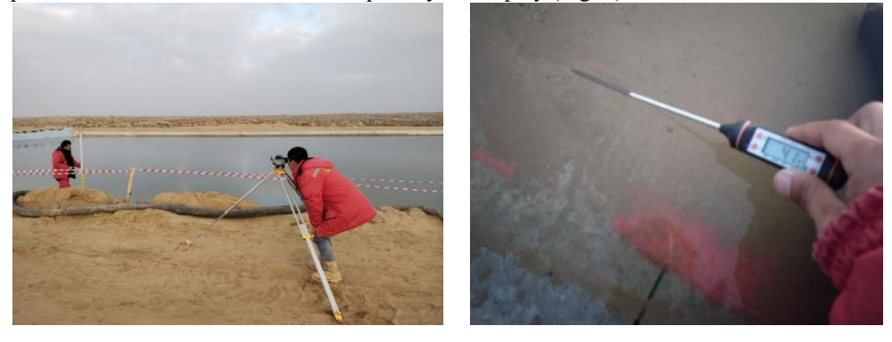
Fig. 5. Checking the water level

Water levels in the experimental area were measured 3 times a day using a levelling machine (Fig. 5). The weather conditions were taken according to the data of the Turtkul meteorological station: wind speed, air temperature and humidity. The water temperature was measured using a WT-1 digital thermometer with a stainless-steel needle probe with a plastic handle, which has a built-in liquid crystal display (Fig. 6).