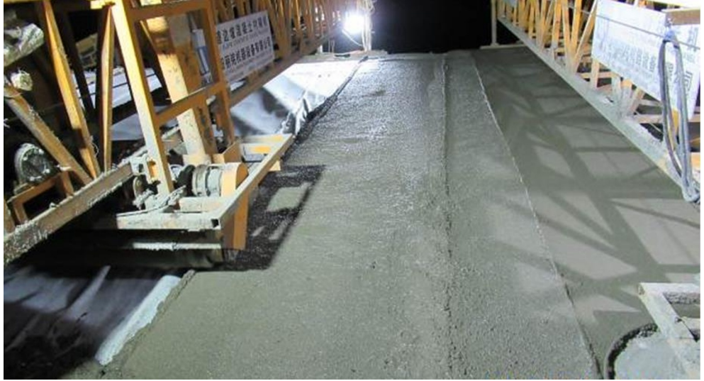
Fig. 2. Placement of concrete on the canal slope over the geotextile/geomembrane

19.8 MPa (19800 kN/m<sup>2</sup>) in transverse direction 31.6 MPa (31600 kN/m<sup>2</sup>) elongation at break 940%. A fibric needle-punched non-woven geotextile weight at least 250 g/m<sup>2</sup> was installed above the geomembrane (Fig. 2). Seamwas performed by melting with a LT 900 device. Concrete class B25 with 12 cm thick was placed using a concrete lining machine[28,35].