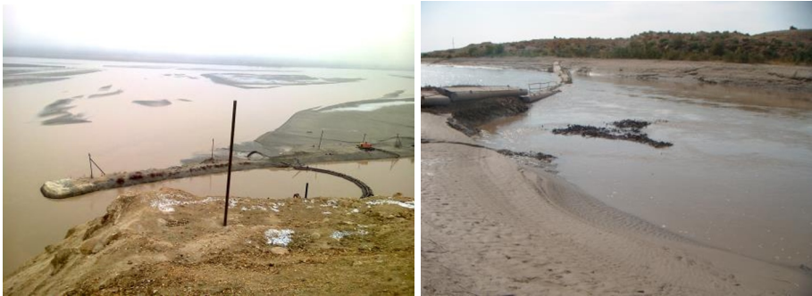
Fig. 3. Installation of floating seal at water intake of KMC

channel, it is possible to install a trapdoor of a similar design on the last bend in front of the pumping station (Fig. 3).