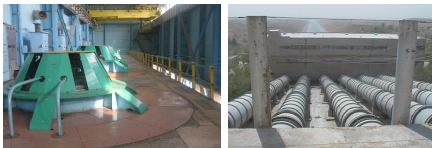
Fig. 4. Layout of units in engine room and hydraulic devices for breaking vacuum on pressure pipelines

At Karshi PS-6, six units of the same type were subject to control tests (Fig. 4). The design parameters of pumps - OPV 10 - 260G and OV 10 - 260 were compared: flow up to 38-40 m 3 /s, head - 24 m, minimum flooding - 7.0 m, efficiency - 86% with field data [15,16].