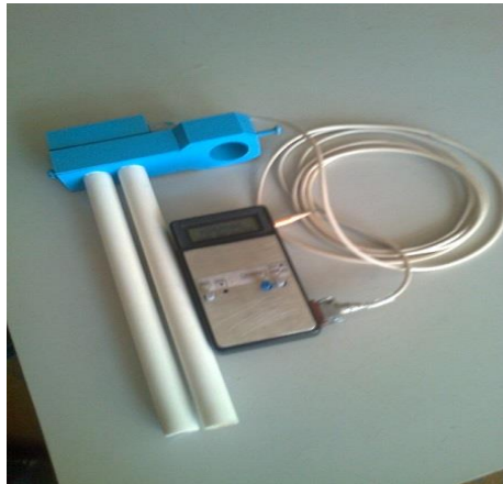
Fig. 4. Water speed meter

The device structurally consists of two parts: a sensor and an electronic signal processing unit, electrically connected to each other. The sensor is a converter of the water velocity into an electrical signal and is lowered to the controlled point of the water flow. The electronic unit processes the sensor signal according to the specified algorithm and displays the final result in digital form in units of speed.