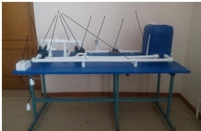
Fig. 3. General view of the laboratory stand

The main design details of the laboratory stand include the following (Figure 3):