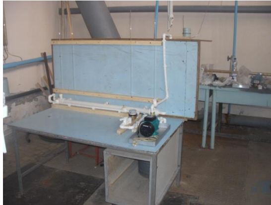
Fig. 2. Photos of the laboratory stand installation the stand is made in floor version.

The stand includes a table; piezometer shield; flow meter, intake manifold; piezometers 4; pressure pipelines; two tanks at different levels, pump with a built-in check valve. Two pipelines are fixed on the table surface, one 40 mm, the second 105 cm.